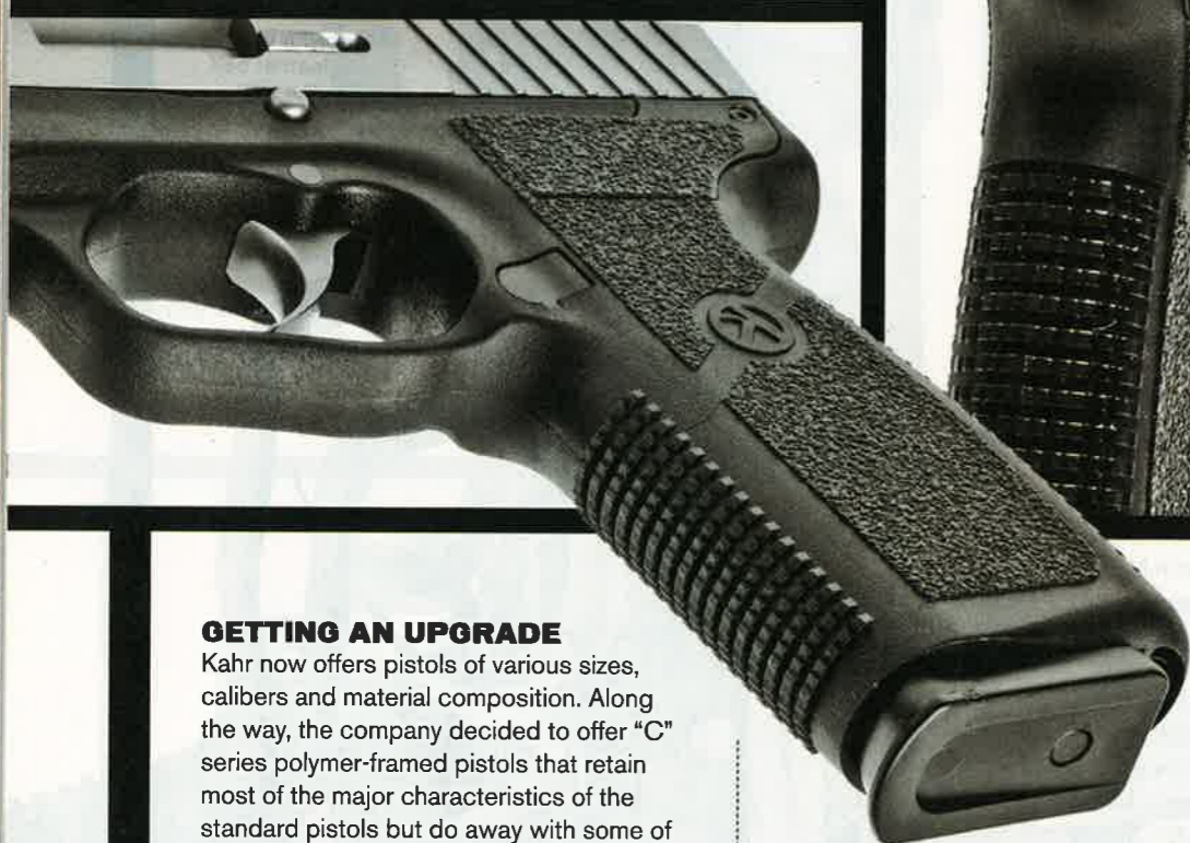
← The sides of the polymer grip frames have subtle non-slip texturing while the front- and backstraps are more aggressive for a secure hold.