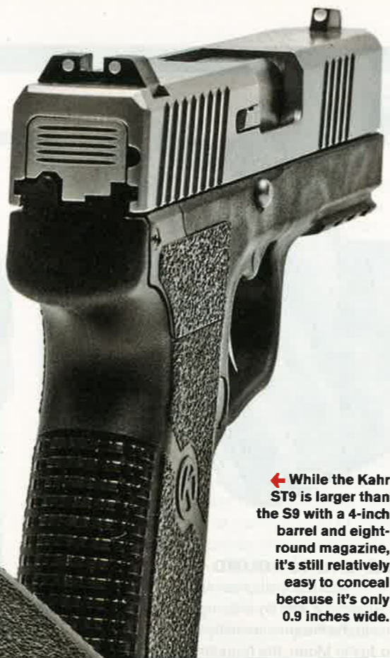
← While the Kahr ST9 is larger than the S9 with a 4-inch barrel and eight-round magazine, it's still relatively easy to conceal because it's only 0.9 inches wide.

“Measuring just 0.9 inches wide, the two ‘S’ series pistols are extremely concealable under a loose garment—even just a pullover shirt.”