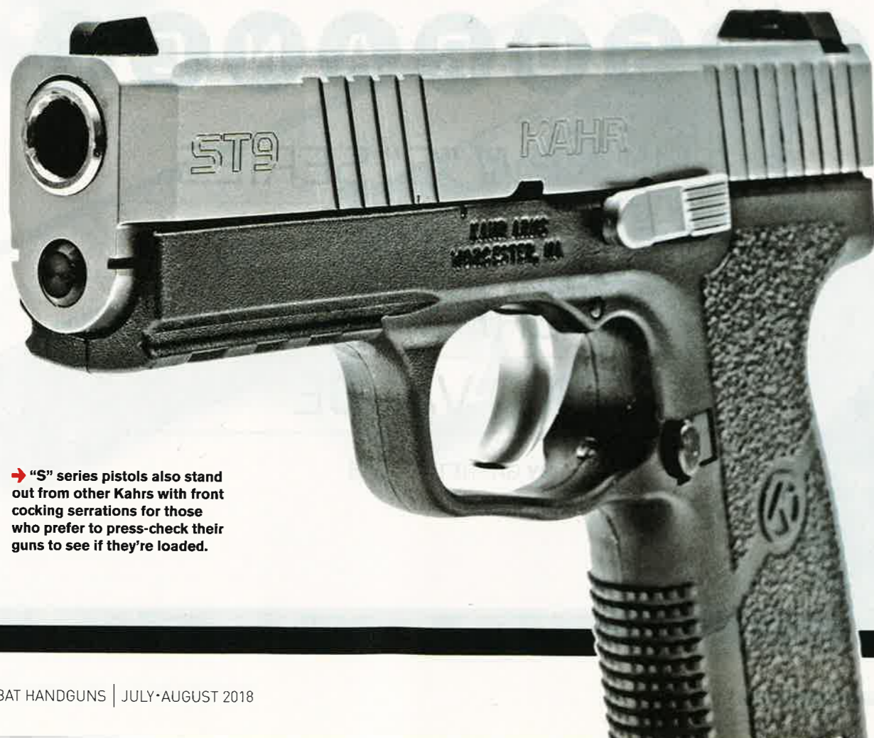
→ "S" series pistols also stand out from other Kahrs with front cocking serrations for those who prefer to press-check their guns to see if they're loaded.

Such is the case for Kahr Arms, its history and its most recent additions to its product line. In the summer of 2017, Kahr introduced two pistols, the S9 and ST9, as part of its new "S" series. This new line is placed just above Kahr's Value Series pistols as a way to offer a few additional features while still being very affordable.