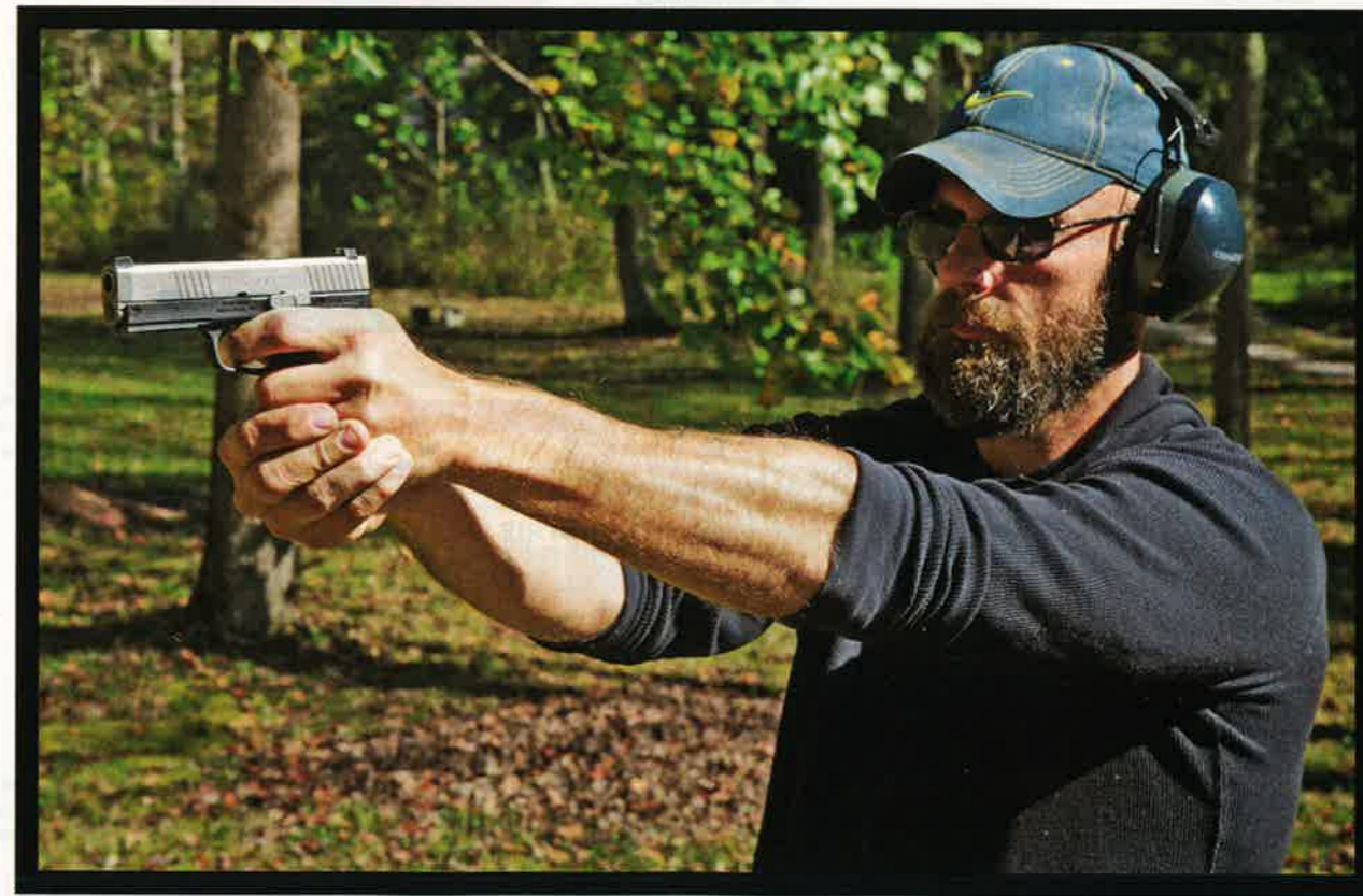
↓ The 4-inch-barreled ST9 ran flawlessly right out of the box and printed nice groups at 15 yards, thanks in part to its smooth, consistent trigger pull.

Like other models from the Kahr lineup, the S9 and ST9 utilize Kahr’s proprietary trigger-cock-