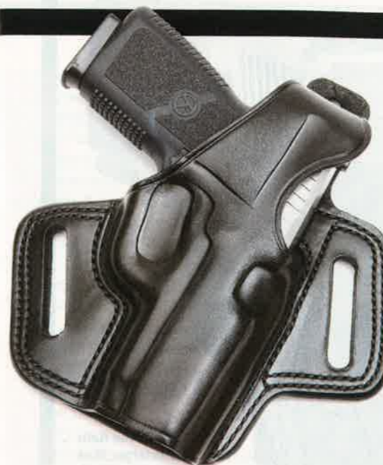
← The S9 is more compact than the ST9 with a 3.6-inch barrel and a seven-round magazine. The author tested the S9 with Galco's Fletch leather belt holster (far left).