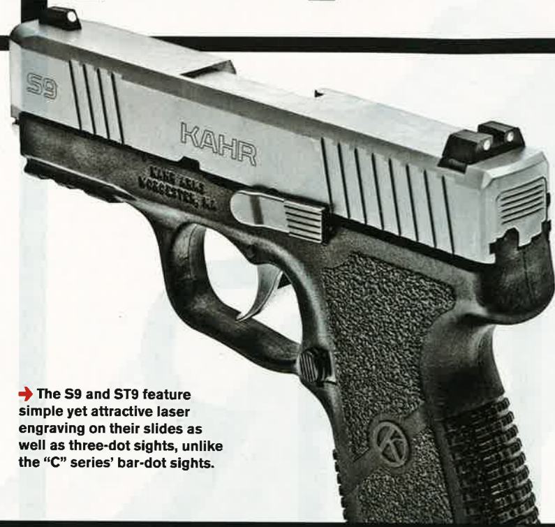
→ The S9 and ST9 feature simple yet attractive laser engraving on their slides as well as three-dot sights, unlike the "C" series' bar-dot sights.