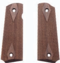
1911 Wood Grips

To order parts by Parts Name and Part Number refer to Owner's Manual page 22 and page 23. Please refer to the separate order sheet and price list included with the firearm packaging to place orders.