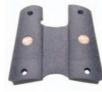
Wrap-around Grip with Medallion