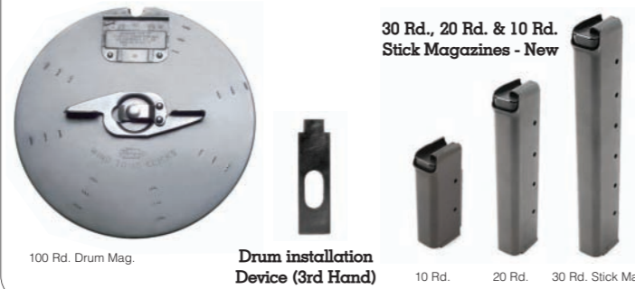
30 Rd., 20 Rd. & 10 Rd. Stick Magazines - New

100 Rd. and 50 Rd. drum magazines are prohibited by state law in CA, HI, MA, MD, NJ, NY.